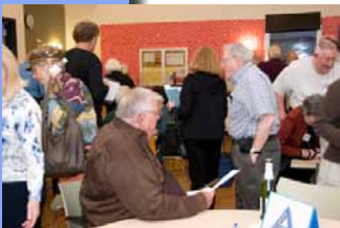
Time to move to the next round

Everyone is encouraged to bring one photo print (any size, any subject) to each meeting.