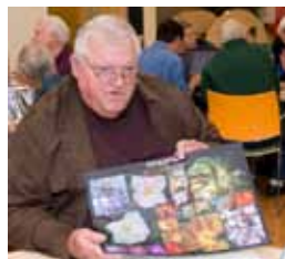
Kermit shares a collage